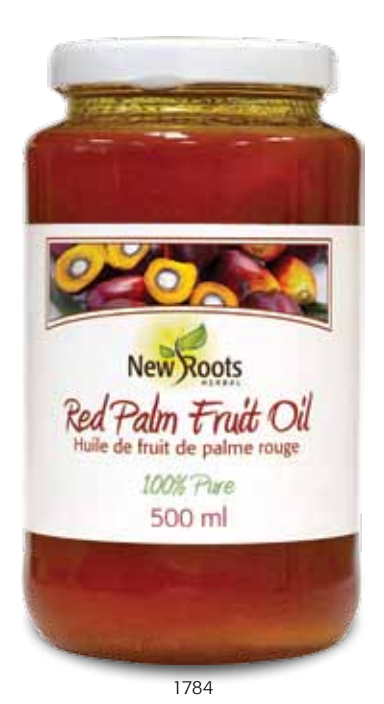
Plus, it can help protect the skin from UV-ray damage and premature aging. Red palm fruit oil is utilized directly by the liver and is not stored like most conventional oils. This ignites the metabolism and increases the rate in which calories are burned

The potential benefits from including red palm fruit oil in your diet extend well beyond heart and head. The antioxidant power of this unique oil may help protect against diseases such as osteoporosis, cataracts, macular degeneration, arthritis, and liver disease.